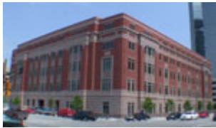
Family Law Center 200 E Weatherford Street