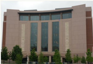
Tom Vandergriff Civil Courts Building 100 N Calhoun Street