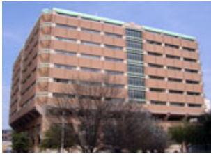
Tim Curry Criminal Justice Center 401 W Belknap Street