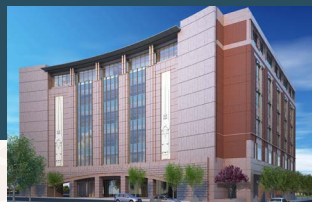
Tom Vandergriff Civil Courts Building

401 W Belknap Street Fort Worth, TX 76196