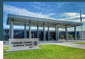
Scott D. Moore Juvenile Justice Center

100 N Calhoun Street Fort Worth, TX 76196