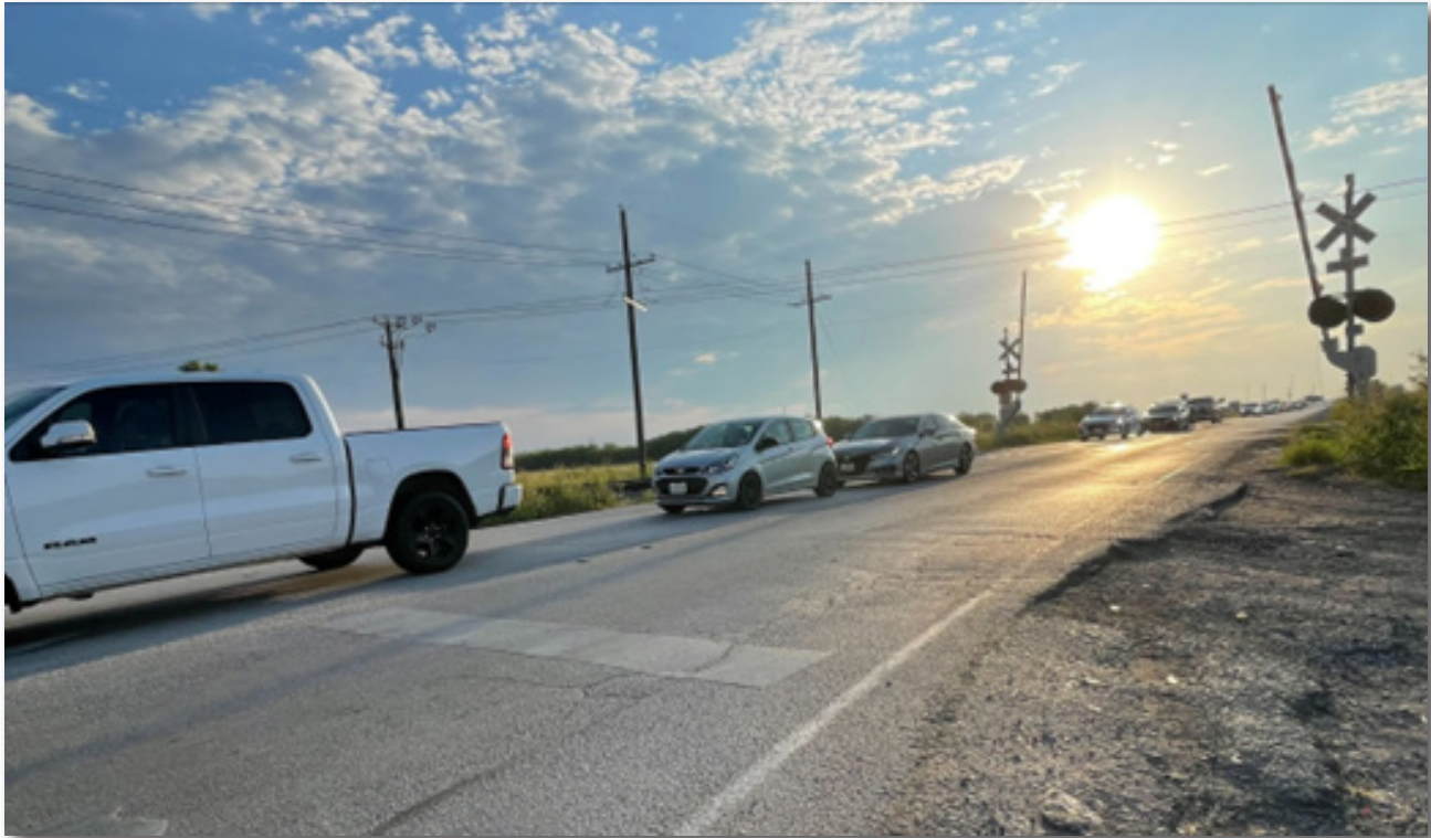
The Bonds Ranch Corridor is a current project involving Tarrant County, TXDOT, City of Fort Worth, NCTCOG, EMS-ISD, and local developers.

While Tarrant County does not have a role in selecting developers for open land, Ramirez emphasized the importance of maintaining open communication with developers, local municipalities, and government partners. By fostering collaboration from the start, the county ensures that all parties are aligned on creating transportation systems that reflect the region’s growth while preserving the high standards residents expect.