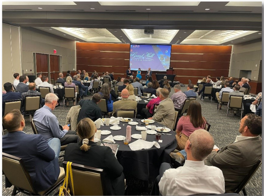
The meeting was well-attended by local government officials and professionals in civil engineering